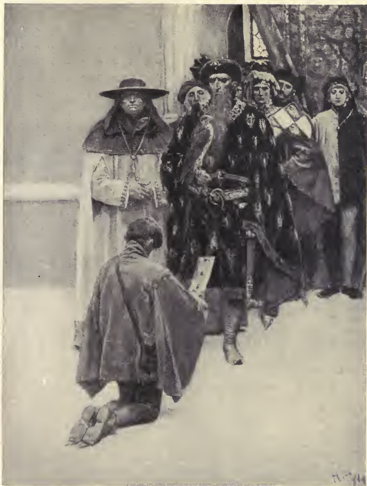
"Myles, as in a dream, kneeled and presented the letter"